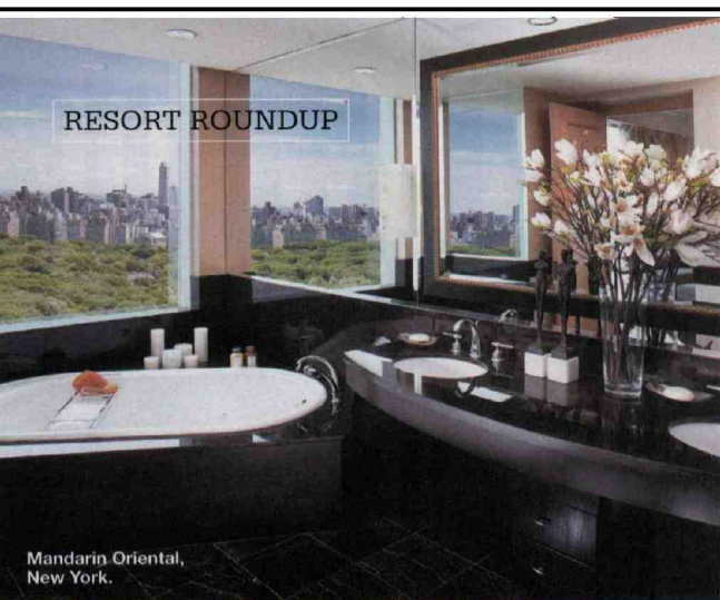
Mandarin Oriental, New York.